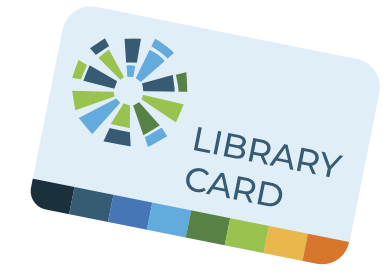
337,633 57% of County Residents